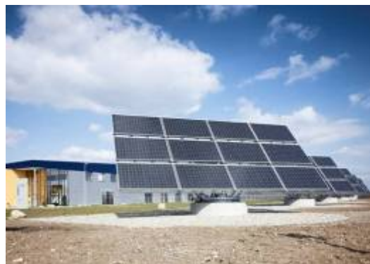
Photovoltaic as renewable energy source