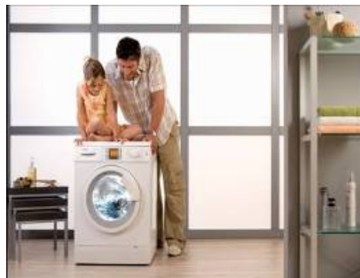
Energy-efficient household appliances