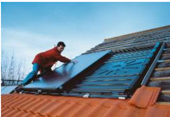
Solar thermal systems for heating and hot-water