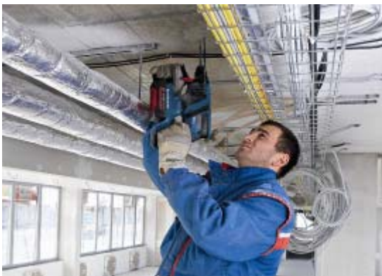
Innovative power tools with lithium-ion technology